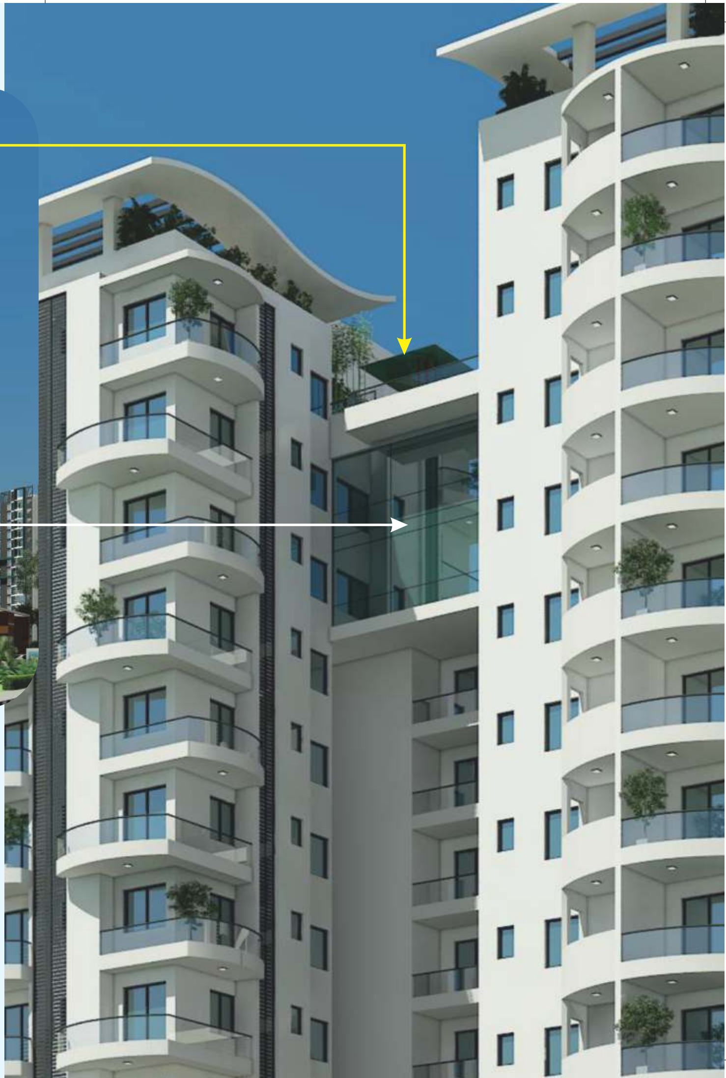
Rooftop Swimming Pool "Open to Sky"